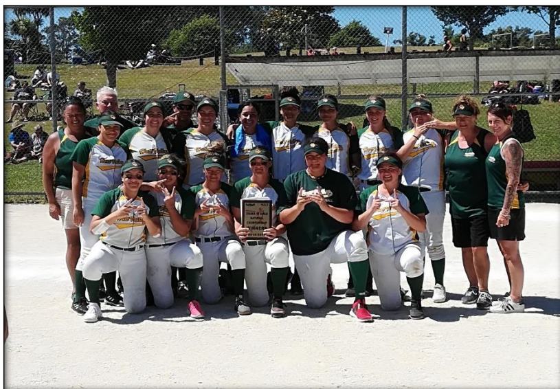
1st Place –Hutt Valley