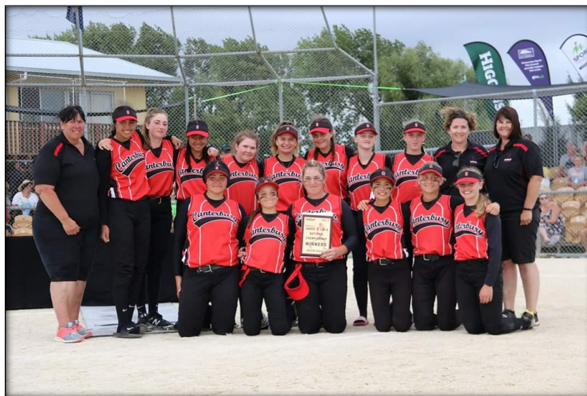
1st Place –Canterbury