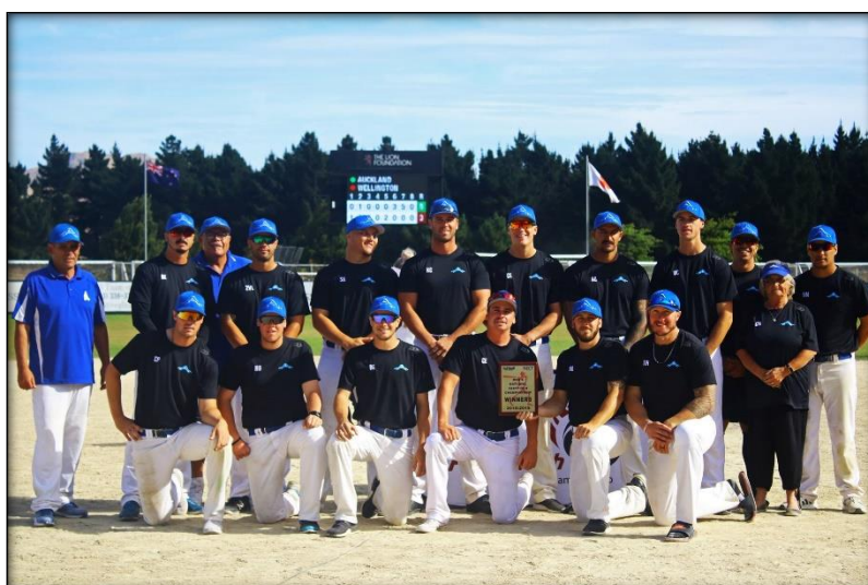
1 st Place – Auckland