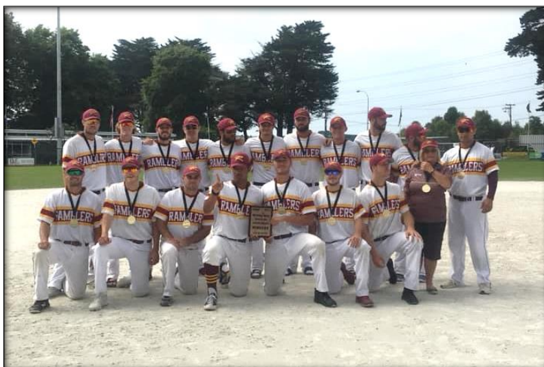
1 st Place – Mt Albert Ramblers