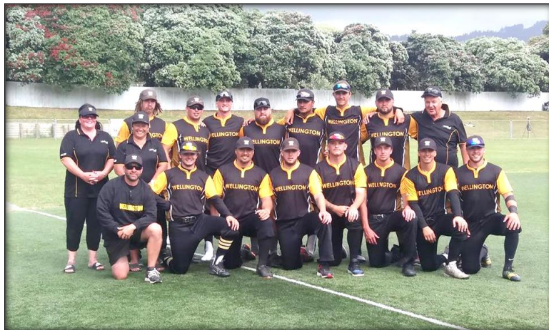
1st Place - Wellington