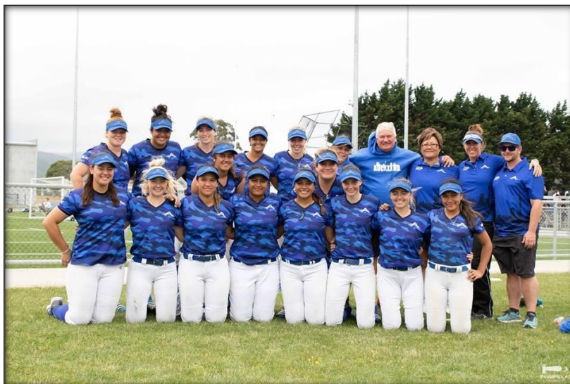
1st Place – Auckland A