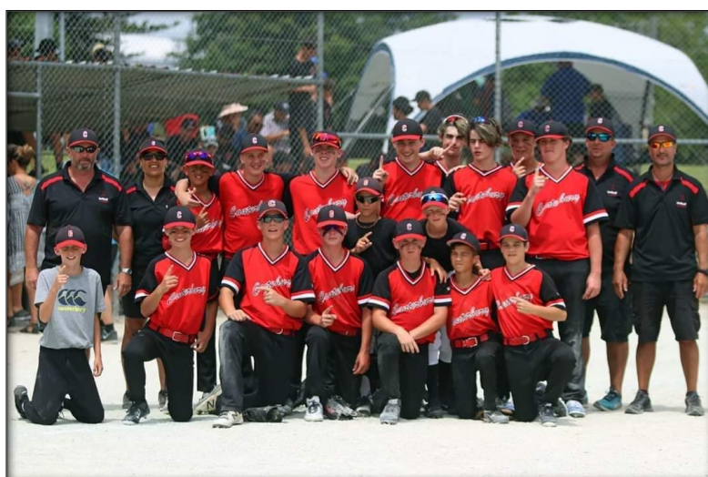
1st Place – Canterbury