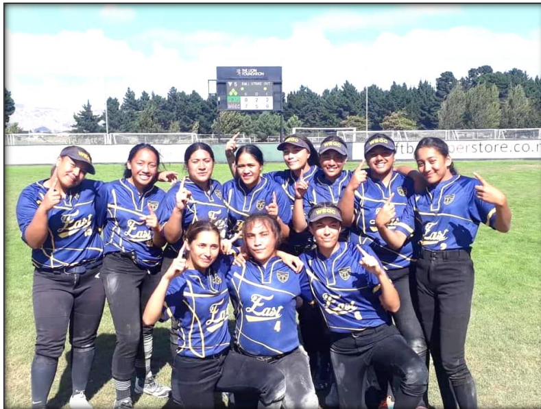
1st Place – Wellington East Girls' College