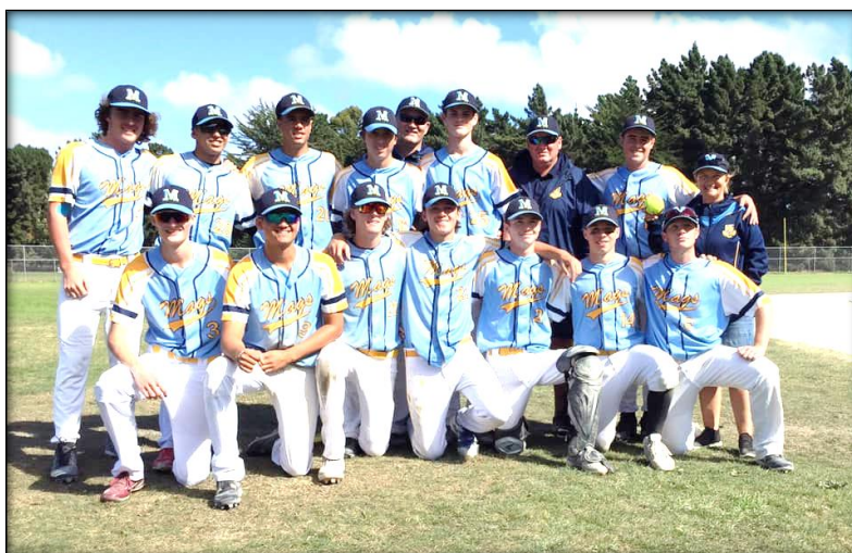
1st Place - Mt Albert Grammar School