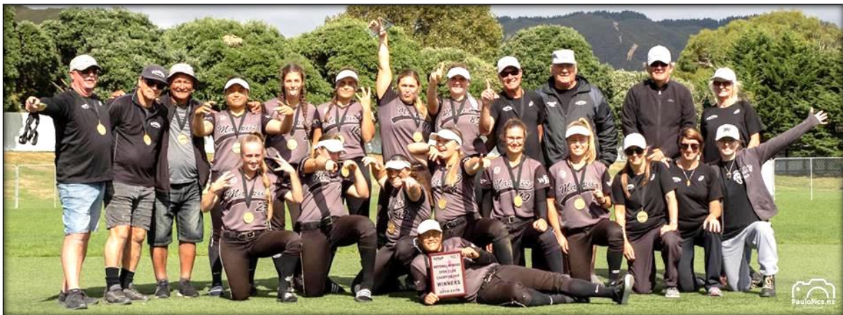
1st Place –Magpies