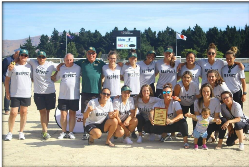
1 st Place – Hutt Valley